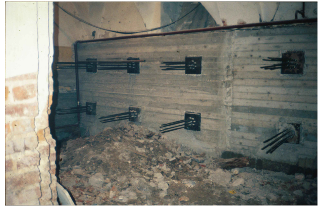
Photograph 3. Concrete beam h \times b = 2,0 \times 0,5 m 2 against the old cellar wall and pre-tensioned anchors.

Steel wedges of the heads of the piles were covered with concrete casting.