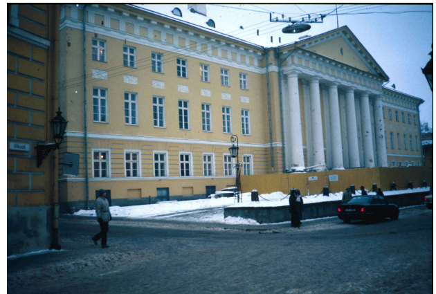
Photograph 2. The University building during the work in 1995.

Before the actual strengthening work, some major empty cavities under all the walls were filled with concrete. Filling was made side by side with archeological digging. Archeological digging was carried out stage by stage ahead of piling work.