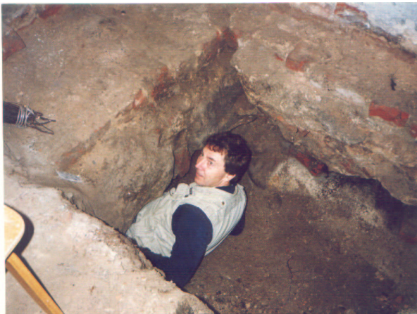
Photograph 1. In situ proof under foundation.

In early 1990's it was noticed that the situation under the center part of the building started to be critical. In pre-work archeological diggings the wooden rafts were in some places totally rotten leaving empty cavities at a place they used to be. To proof the situation of cavities, the main author of this paper was asked to be in situ under the foundation (Photograph 1). Especially the area of the main entrance needed immediate repair to prevent any serious damage of the building (Photograph 2).